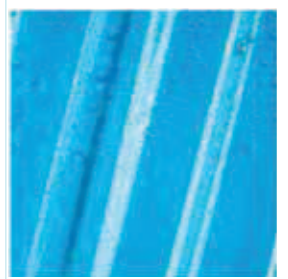
Opaque (or transparent) layer of large droplets