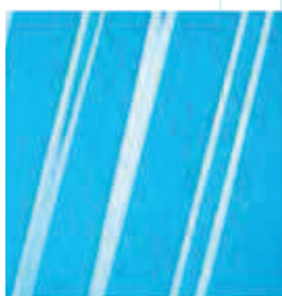
Transparent film with no visible water