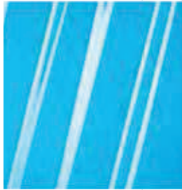
Transparent film with no visible water